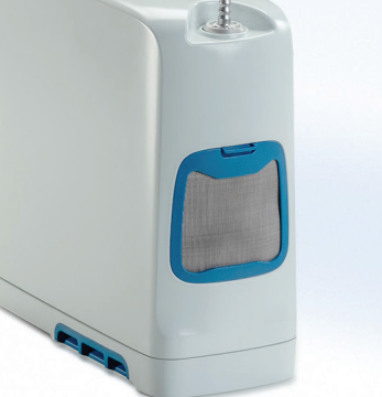
Inogen Rove 6 Portable Oxygen Concentrator (Catalog Number IO-501)